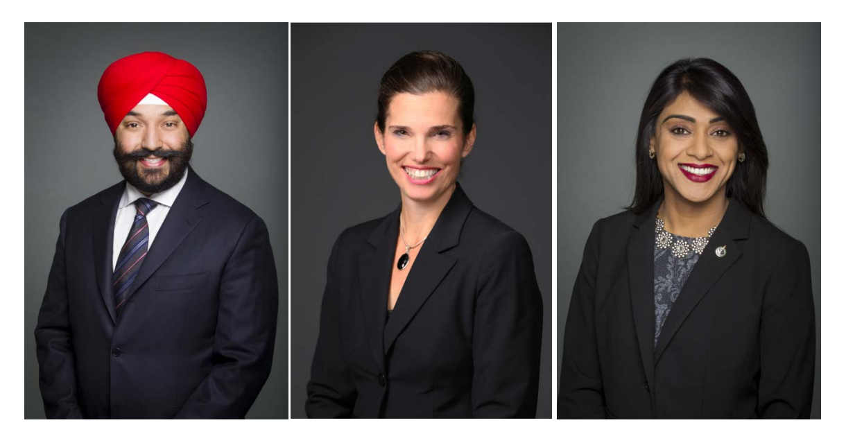
The Honourable Navdeep Bains Minister of Innovation, Science and Economic Development

It is our honour to present the 2015–16 Departmental Performance Report for SSHRC.